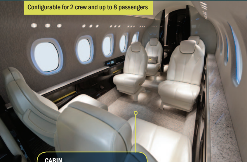
Configurable for 2 crew and up to 8 passengers